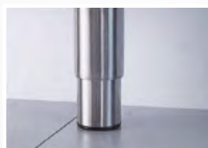
Piedini in acciaio inox regolabili in altezza (+60 mm) S/s feet with adjustable height (+60 mm)