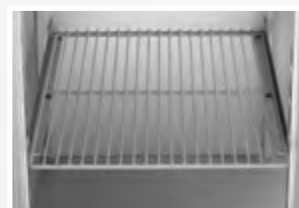
Guide a "L" per griglie EN400X600 S/s runners for EN400X600 shelf