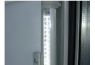
Illuminazione a led LED lighting

*Modelli ventilati: controllo elettronico di temperatura; modelli statici: regolazione temperatura con termostato meccanico. *Fan assisted model: electronic temperature control; Static models: temperature control with mechanical thermostat.